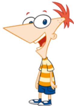
Phineas gg, ff, Ss, BB